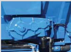
40-1 German reduction gearbox