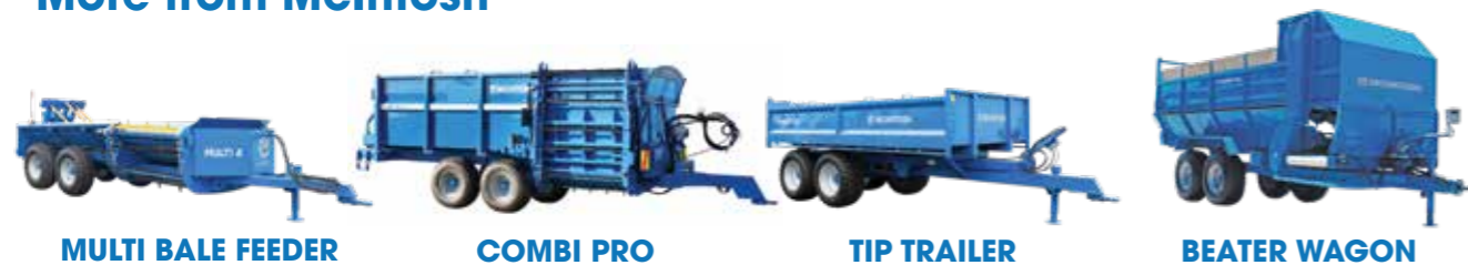
MULTI BALE FEEDER