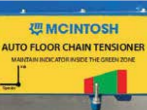
Auto floor chain tensioner (optional)