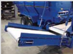
Pivoting cross conveyor with tracking strip (optional)