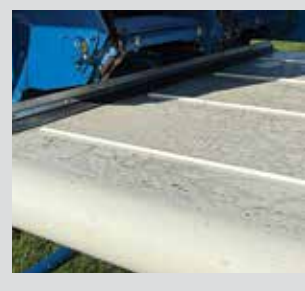
Cross conveyor with tracking strip