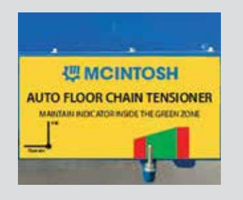
Auto floor chain tensioner