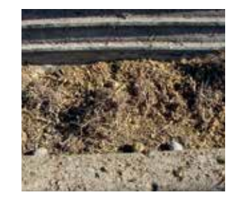
Mixed feed - maize, potatoes and hay

NB: All weights and measurements are approximate and dependent on specifications and may change without notice.