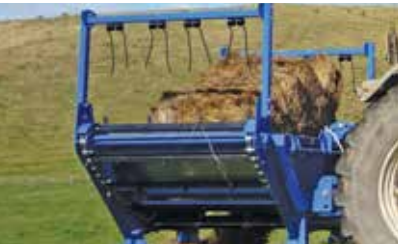
Square bale attachment