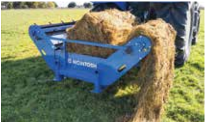
Feeds out either side