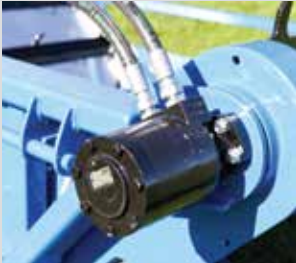
3000 PSI motor with 1 1/4" shaft and large key