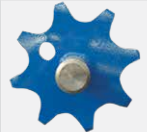
8 tooth sprocket for extended chain life