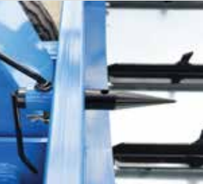
McIntosh aggression pins