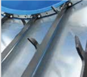
3 and 4 tooth slats grip tough, uneven bales