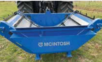
Back panel waste basket