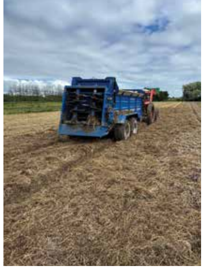
Organic vegetable bed preparation