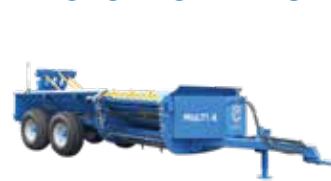
MULTI BALE FEEDER