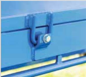
Strong flexible hinge system on fold down sides