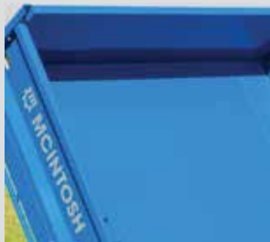
Fully welded side's and floor